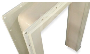
Polystone® P flex dans les usines de galvanoplastie ou de décapage de l'acier