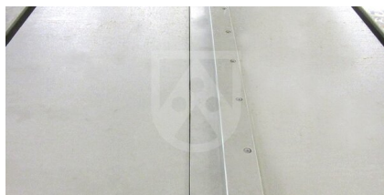
Polystone® P flex dans les usines de galvanoplastie ou de décapage de l'acier